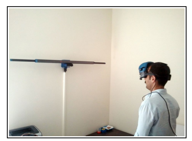
Fig.1: Patient undergoing a VENG test.

For the diagnosis of BPPV, treatment maneuvers were performed with the help of VNG. The modified Epley maneuver was implemented in Group-1 as treatment. Brandt-Daroff exercises (five repeats three times a day) were explained orally and