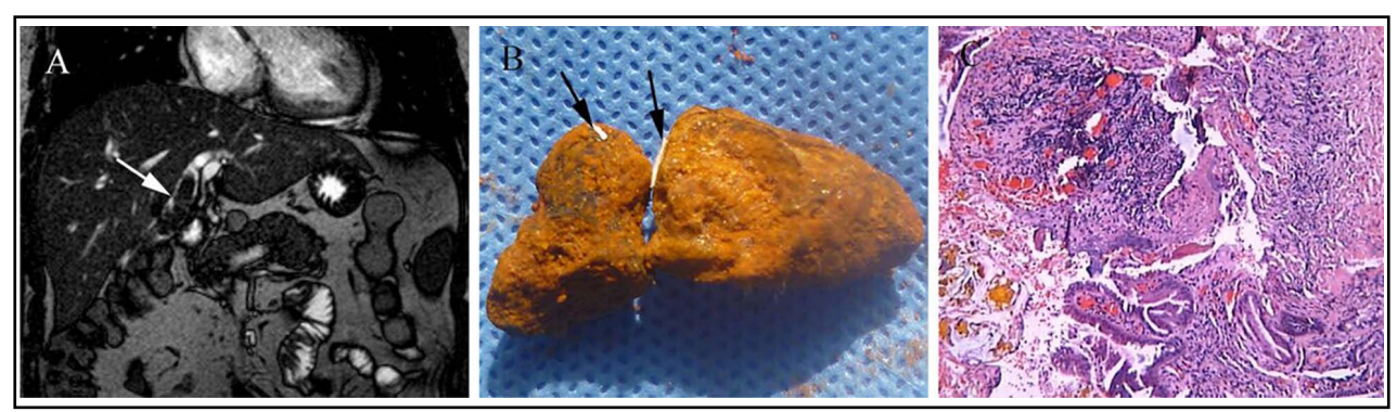
Fig.1: Case 1: A. Magnetic rResonance cholangiopancreatography (T2). The white arrows indicate bile duct stones in the hilum. B. Bile duct stone formed around a Prolene suture. The black arrows indicate the Prolene suture within the stone. C. Pathological examination of the biliary anastomotic tissue.

During the current admission, his laboratory data showed normal liver function with no sign of infection. Colonoscopy and pathological examination adenocarcinoma. showed colon Abdominal ultrasonography identified stones in the bile duct with intrahepatic bile duct dilatation. Computed tomography (CT) showed the intrahepatic bile duct was dilated (Fig.2A). Based on these findings, we concluded that radical laparocolectomy and choledocholithotomy was appropriate for this patient. Following radical laparocolectomy, we opened the bilioenteric anastomosis, and found there were several bile duct stones that had formed around a suture in the enteric end (Fig.2B). On macroscopic examination, the suture was identified as a Prolene suture, which might have been used for overhanging the bile duct wall left in the lumen (Fig.2C). Following the extraction of the stones, the incision at the bilioenteric anastomosis was closed with interrupted 4-0 Vicryl suture transversely. His postoperative course was uneventful without any complications, and choledocholithiasis did not recur after surgery for 18 months follow-up.