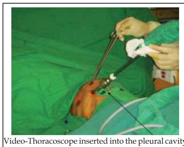
Fig-2: Video-assisted Thoracoscopy (VATS)

Looking at the monitor, the targeted nodal station in the mediastinum is approached. The parietal pleura is lifted up using a grasper and cauterized with care so as not to injure the superior vena cava, phrenic nerve, aorta or pulmonary artery. The nodes are mobilized with blunt dissection via endo forceps and then multiple biopsies are taken under direct visualization on the TV monitor. The same principles are followed for nodal biopsies in the