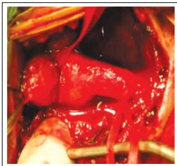
Fig-3: Exploration of the carotid body tumor, image of common carotid artery and its branches during the operation.

CBTs are slowly growing tumors that arise from chemoreceptor tissue in carotid bifurcation. A diffuse mass slowly developing in front of the sternokleidomastoid muscle at the level of hyoid bone on neck should bring that pathology to our minds. The mass may classically be moved laterally, but, as it is adhered to the carotid artery, it cannot be moved medially, which is called Fontaine sign. Murmur may be heard over the mass on auscultation. Although they can be seen at all ages, they generally develop between 30 and 60. 8 They are more frequently seen