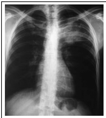
Fig.1: Chest x-ray shows soft tissue density in left upper lobe with a linear metallic foreign body along its inferior aspect.