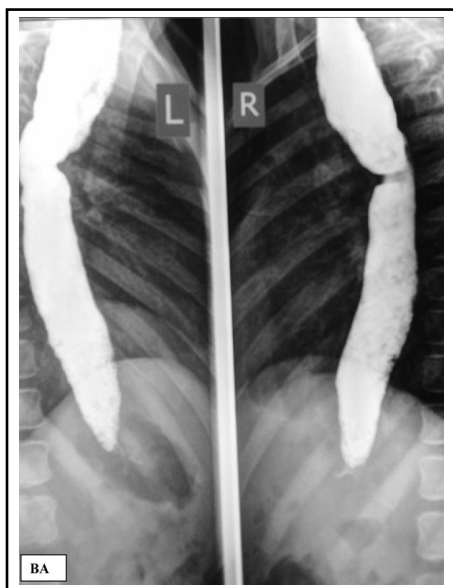
Fig.1: Pre dilatation barium swallow, dilated esophagus.

Based on presentation of achalasia, alacrima and adrenal insufficiency, diagnosis of triple A syndrome was made. She had pneumatic balloon