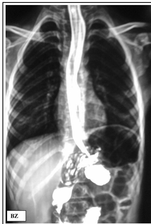
Fig.4: Post dilatation barium swallow, lesser diameter of esophagus.