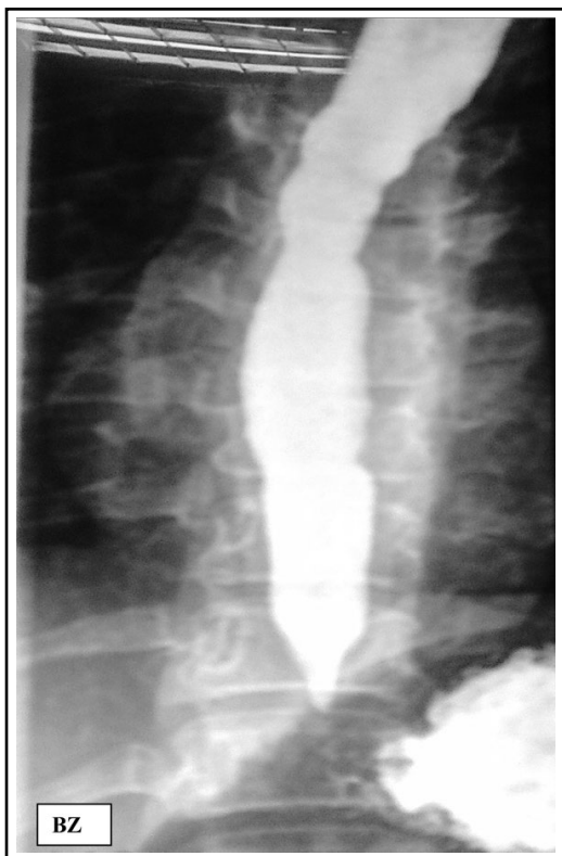
Fig.3: Pre dilatation barium swallow, dilated esophagus.

Allgrove's syndrome is an autosomal recessive disorder with varied presentations. 14,15 Recent studies have identified mutation in AAA syndrome of a candidate gene on chromosome 12 q 13 in