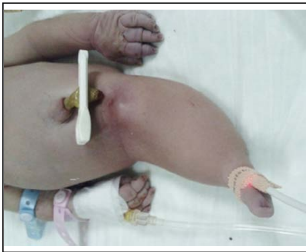
Fig.1: Infant with single lower limb and absent external genitalia.

Anomalies present with sirenomelia sequence could be evaluated as related and unrelated. 5 Related anomalies associated with sirenomelia sequence are single lower limb, renal agenesis, genital and anorectal anomalies, single umbilical artery, low spinal column defects, and large bowel. 1,5,8 Unrelated anomalies have been reported with sirenomelia sequence are radial aplasia/hypoplasia, cardiac defects, central nervous system anomalies, abdominal wall defects. 5 Our case had characteristic features of sirenomelia sequence which are single lower limb, bilateral renal agenesis,