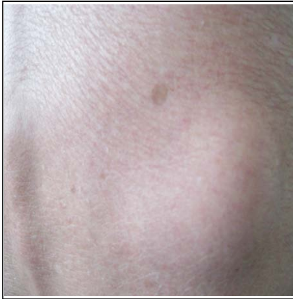
Fig.1: Protrusion in the lateral right the lumbar area.

Computed tomography (CT) scan confirmed the presence of right lumbar hernia containing fatty tissue. After treatment of regular oral theophylline sustained release tablets and prednisone acetate tablets, his respiratory symptoms improved obviously. The patient refused operation and was discharged from the hospital one week later.