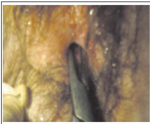
Fig-3: A cleavage was found and opened via a clamp through labia majora. Great amount of urine was discharged from the opened channel.

Thereafter with sharp dissection, labia minora were separated from each other and also vertically from the labia majora. The labia majora, labia minora, the orifice of urethra and clitoris now could be clearly distinguished (Fig-4). Each of the three sulci were