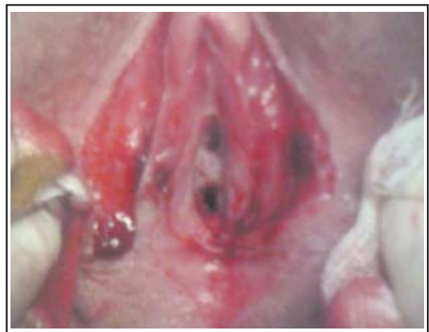
Fig-4: With sharp dissection, labia minora were separated from each other and also vertically from the labia majora. Examination of the vulva after the separation revealed a normal vagina & urethral opening.

Fusion of the labia minora is mostly a pediatric condition seen from three months to three years of age. In newborn period, it is not evident. During childhood, the incidence of labial fusion is 1.8%.