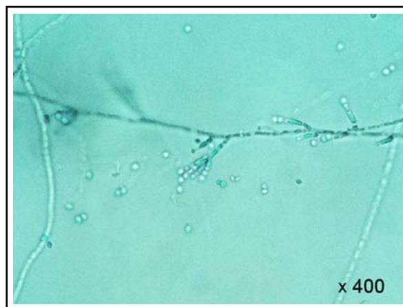
Fig.2: Lactophenol cotton blue stain of Paecilomyces lilacinus from slide culture.

Paecilomyces lilacinus infections mostly manifest as either oculomycoses or cutaneous infections, 2 neither of which were apparent in our patient. In South East Asia, Penicillium marneffeii infection is an AIDS-indicator illness with cases being reported from Malaysia since 1995. 4 In northern Thailand,