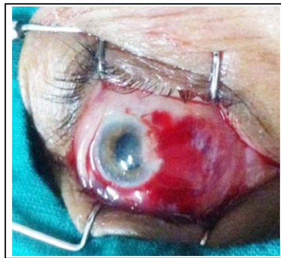
Fig 2: Peroperative: Bare Sclera to apply MMC.