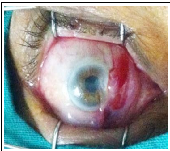
Fig 1: Peroperative: subconjunctival xylocaine 2% injected

The study was conducted at department of Ophthalmology, Ziauddin University Hospital, Keamari, Karachi from July 2013 to October 2013. The patients with primary pterygium with recurrent inflammation, impaired vision or cosmetic disfigurement were selected randomly for pterygium excision with either intraoperative MMC or conjunctival autograft. While those with recurrent pterygium, glaucoma, conjunctival scarring or dry eyes were excluded. All patients were allocated to two groups "A & B" at random and were operated as day case procedure. All the patients were explained regarding expected outcome with the use of MMC or Conjunctival Autograft. The detailed examination of anterior and