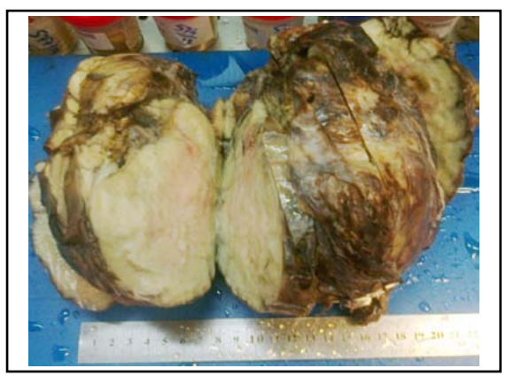
Fig.3: View of a single multi nodular encapsulated pale white firm piece of tissue after removal.

After thorough discussion and multiple settings; patient was counselled for surgical removal of the mass and its catastrophic outcome in case of further delay. Explorative thoracotomy was done and a huge extra pleural mass was removed. Right upper lobe of the lung was also adherent to the mass. Careful incision was performed to remove the mass preserving the surrounding vascular structures with minimal blood loss. The size of excised mass 24 x 20cm x 8cm and it was 3150gm in weight. (Fig.3). The lower and middle lobe collapse was