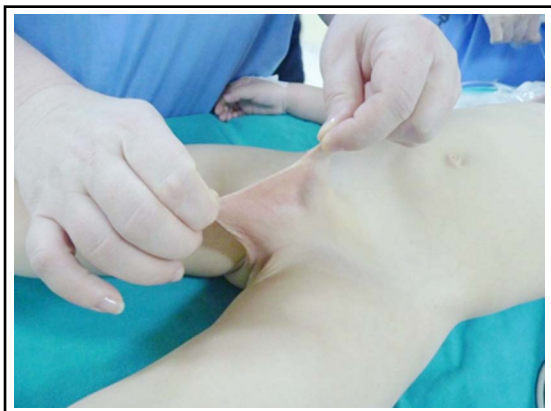
Fig.1: Webbed penis with a distorted penoscrotal angle.

in nine patients but dorsal plication was carried on in one boy. The ventral curvature in a patient is showed in Fig.2.