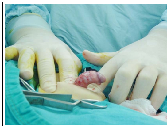
Fig.2: Chordee without hypospadias, the penis is degloved.

Circumcision is one of the most commonly applied surgical procedures in children, especially in those regions where it is ritually performed due to social and religion-based factors. 1-3 Routine circumcision is commanded in Judaism and is accepted as sunnah in Islam. While it is generally carried on in the neonatal period in Jews, there might be differences between the age distribution of boys undergoing circumcision in Islamic countries. Baky Fahmy et al. stated that nearly all of the routine circumcision