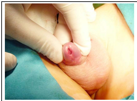
Fig.4: Glanular hypospadias is detected with the retraction of the foreskin.

retraction. Ballooning in the distal penis might be observed due to physiologic phimosis but it is also not an indication for circumcision. The medical and nursing practitioners should be enlightened about the natural progression of the foreskin development in order to prevent admissions of the frightened parents in expectance of urgent operation. Pathologic phimosis, on the other hand, can cause recurrent balanoposthitis attacks as it was detected in 39 cases of this series. The children with prenatally detected urinary tract anomalies such as hydronephrosis or vesicoureteric reflux are more vulnerable to urinary tract infections and circumcision is generally recommended in the follow-up of these children. Zareba et al. declared that uncircumcised status of a boy was one of those independent risk factors for febrile urinary tract infection. 2,5,8,9