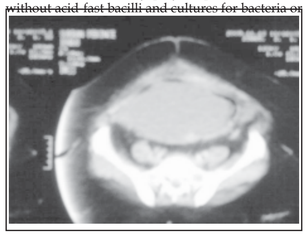
Fig-1: An abdominal CT scan showed a 20 by 10- by 5-cm fluid collection in the abdomen.

The patient was febrile upon admission (temperature, 38.8°C). The right inguinal hernioplasty site was erythematous and tender. Laboratory data demonstrated an increased total white blood cell count with neutrophilia (88%). An abdominal CT scan showed a 20 by 10- by 5-cm fluid collection in the abdomen (Fig-1, 2). Extensive debridement of the abdominal wall and preperitoneal space was performed, and the prosthetic mesh was removed. The patient initiated broad spectrum intravenous antibiotherapy and percutaneous drainage (PCD) guided by ultrasound was performed, with aspiration of grossly purulent fluid. A catheter was placed for six days, obtaining 110 ml of pus. (Fig-3) Microscopical examination of the fluid showed many polymorphonuclear cells