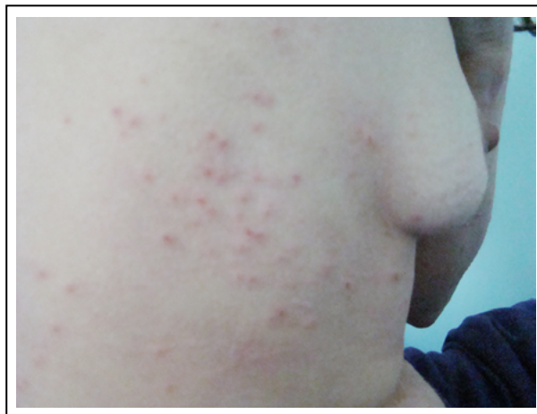
Fig-2: Diffuse vesiculopustular rash on her trunk.

skin diseases, such as atopic dermatitis, Wiskott-Aldrich syndrome, pemphigus foliaceus, ichthyosis vulgaris, bullous pemphigoid, seborrheic dermatitis, psoriasis, irritant contact dermatitis and Darier's disease. 1-4 Mycosis fungoides, burns, traumatic facial abrasions may very rarely be complicated by KVE. 5-7