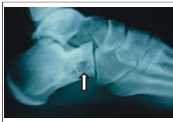
Figure-1: Lateral radiograph of left calcaneus showing findings of osteomyelitic.

Although foreign body-related penetrating injuries of the extremity are common, foreign bodies in bone tissue are rarely seen. 3 Making a diagnosis based on the history is quite easy in acute foreign body injuries. However, making a diagnosis becomes difficult in neglected or older cases or when it is thought that the foreign body has been completely removed. 4 Difficulty in diagnosing wooden foreign bodies is a