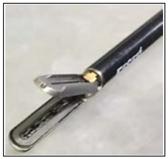
Fig.2: The Ligasure Device

of granulation tissue on 14^{\text{th}} post operative day was observed in 24 (n=29) patients of group A but granulation tissue appeared only in 16 patients (n=26) in group B.